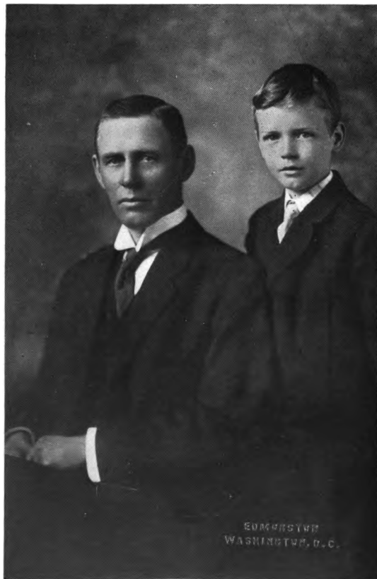
CHARLES A. LINDBERGH AND SON, CHARLES A., JR.