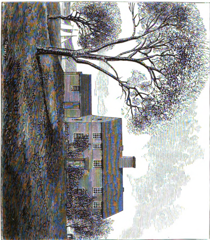
THE JACOBS HOUSE.