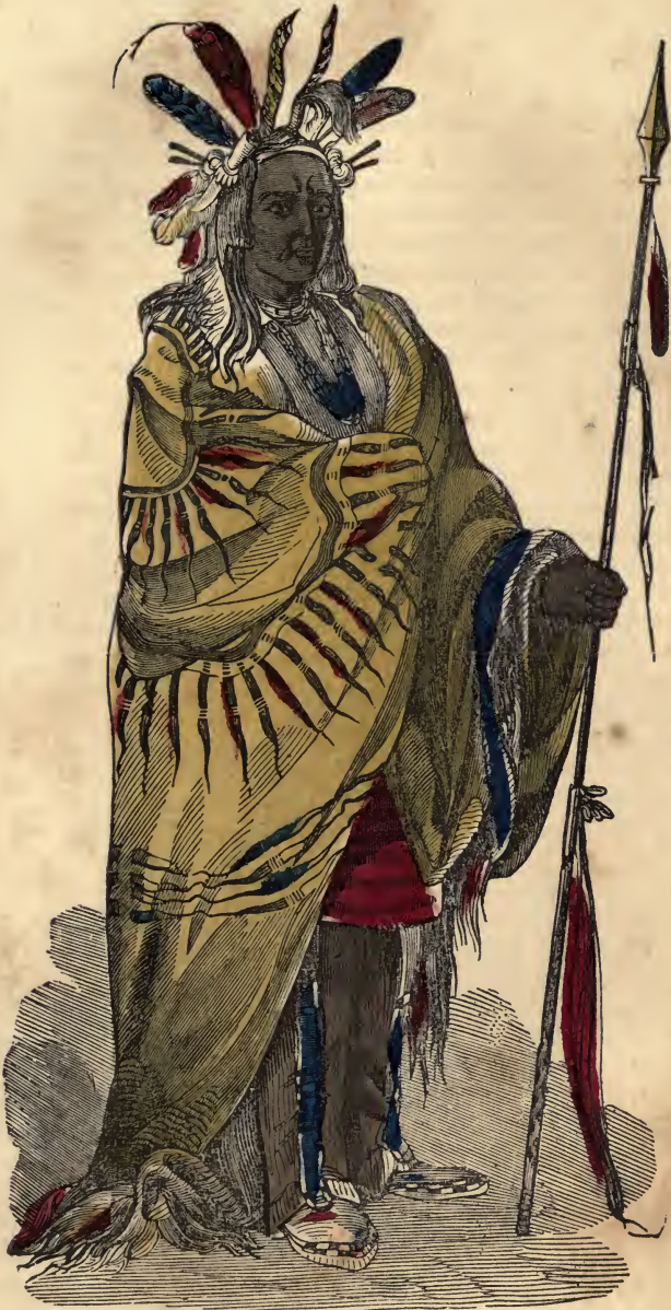
TOTOSON. P. 118.