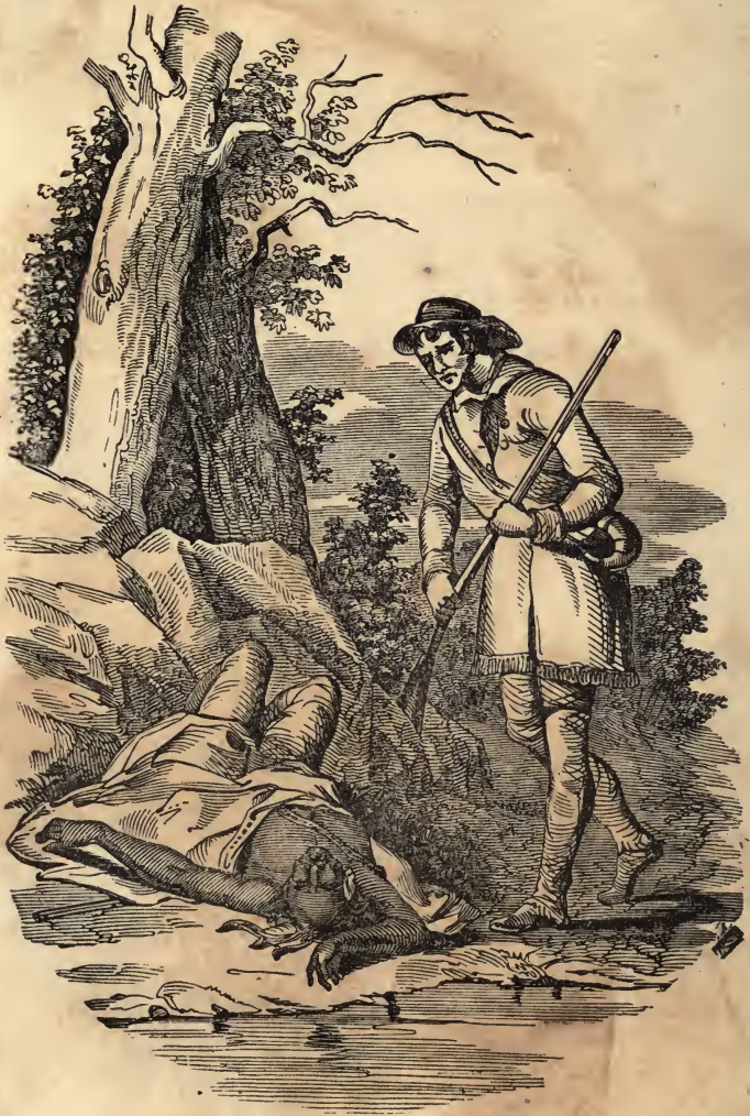
DEATH OF PANGUS. P. 37