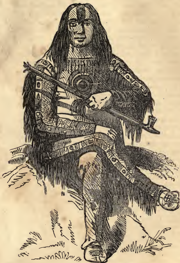
CANONCHET. P. 107.