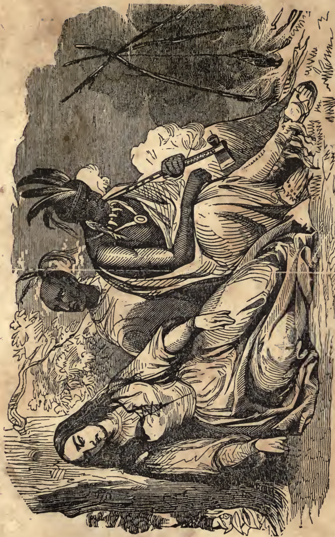
FEMALE CAPTIVE. P. 243.