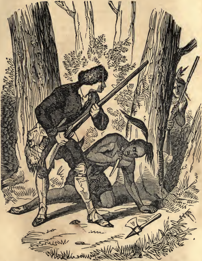
INDIAN PREPARING TO FIRE FROM BEHIND A TREE. P. 44.