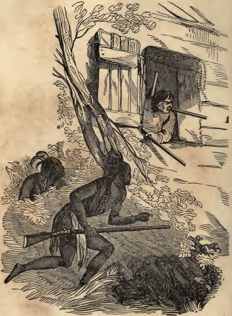
THE FIGHT AT CASCO. P. 168.