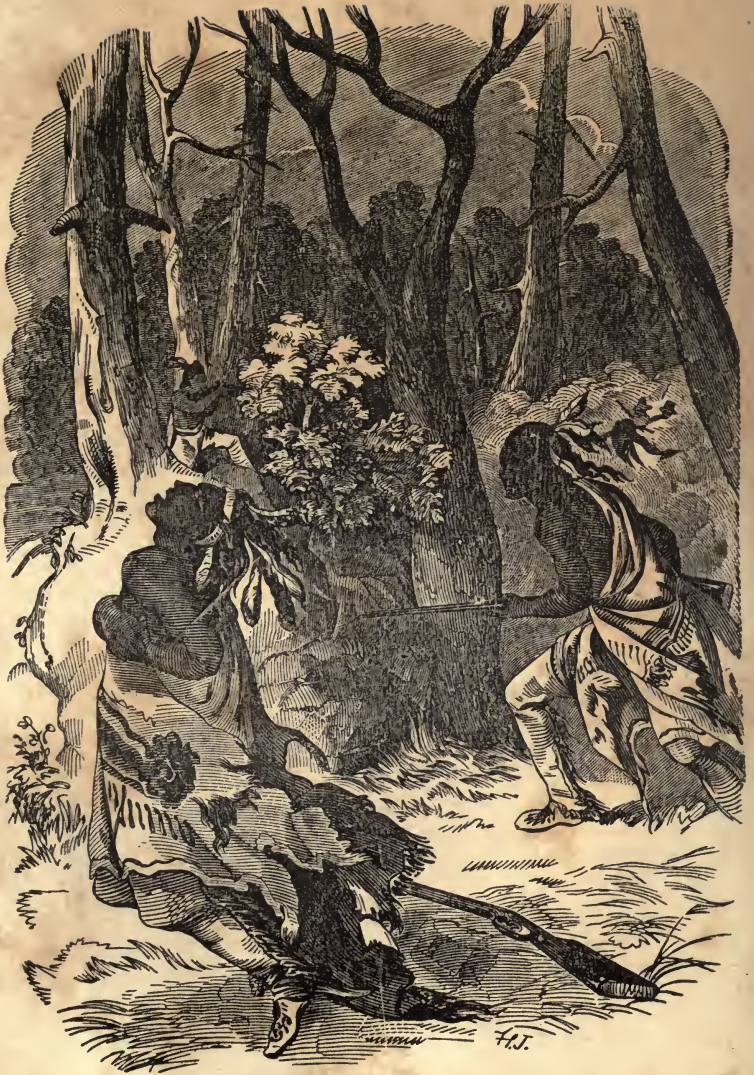
DEATH OF KING PHILIP. P. 123.