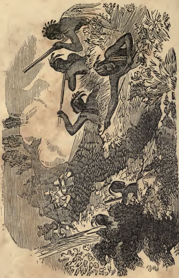
THE NARRAGANSETTS ATTACKED IN THE SWAMP. P. 88.