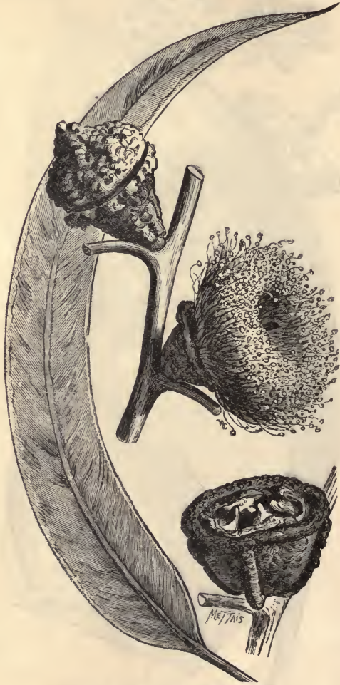
FIG. 6.—EUCALYPTUS GLOBULUS.

Even Eucalyptus Globulus (fig. 6) may be considered as