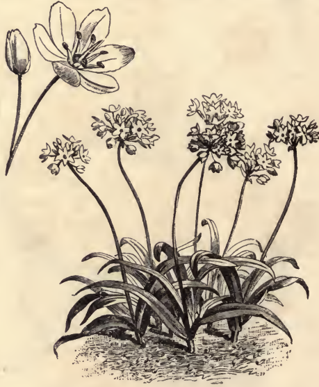
FIG. 11.— ALLIUM NEAPOLITANUM .

Tulips of several species are wild on the coast. T. oculus-solis and the exquisite pink and white T. Clusiana are plucked in the fields. Some early Dutch or Parisian varieties are grown by