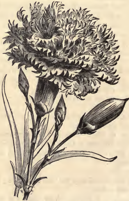
FIG. 8.—DIANTHUS CARYOPHYLLUS FLORE PLENO var. MARGUERITE.

Jean Sisley .—Mottled scarlet and salmon colour, edge bluntly toothed, a very pretty and effective variety.