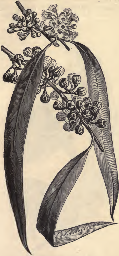
FIG. 5.—EUCALYPTUS ANDREANA.

E. Andreana , Ndn. (fig. 5) is also sometimes sent to the Paris Halles Centrales. The flowers are very small, but