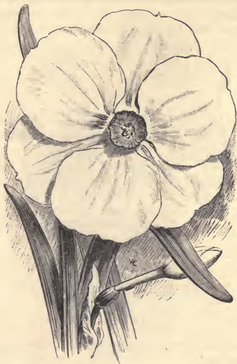
FIG. 10.—NARCISSUS POETICUS ORNATUS.

Gladiolus segetum is very plentiful in a wild state, and it blooms through the cornfields in April.