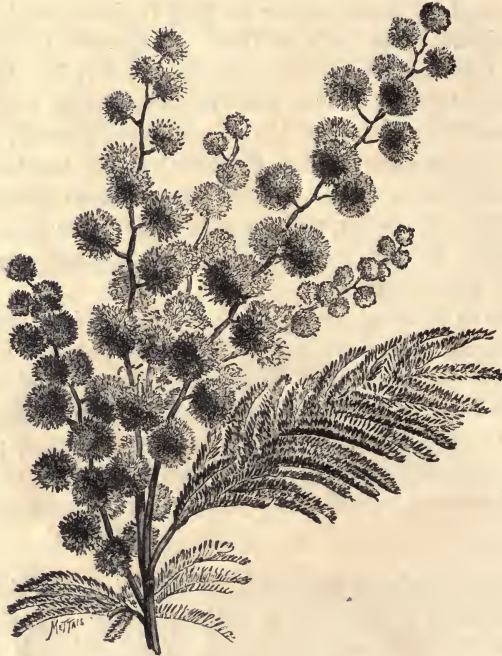
FIG. 1.—ACACIA DEALBATA.

Acacia dealbata (fig. 1) is the sweetest and most graceful,