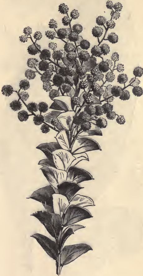
FIG. 3.—ACACIA CULTRIFORMIS.

Eucalypts are profusely planted on the Riviera as ornamental trees. Some species are occasionally relieved of part of their flowering branches for commercial purposes.