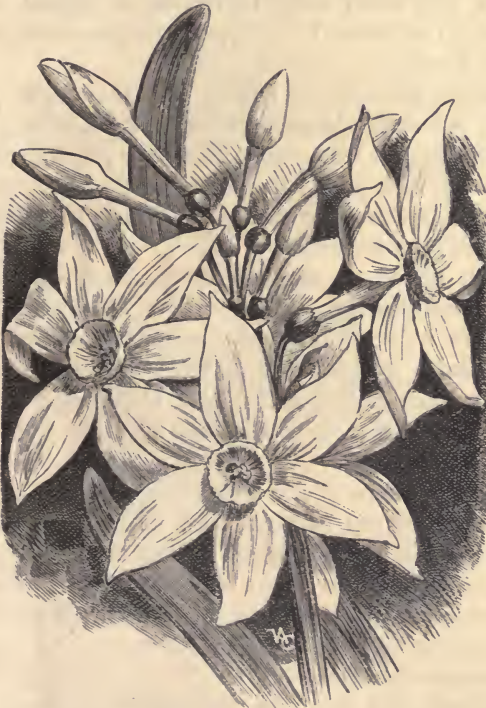
FIG. 9.—NARCISSUS TAZETTA VAR. TOTUS ALBUS GRANDIFLORUS.

Roman Hyacinths are grown on the Riviera for bulbs and for