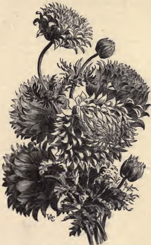
FIG. 13.—ANEMONE ROSE DE NICE.

Mignonette is in great demand in the South, as well as everywhere else. It is grown under screens, just in the same