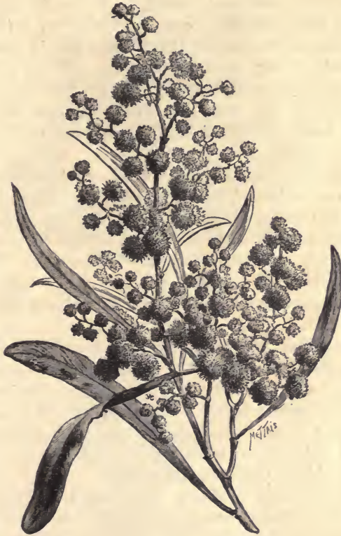
FIG. 2.— ACACIA RETINODES VAR. FLORIBUNDA .

at a pretty high figure (about £2 per cwt. on the spot), owing to the limited area over which the tree will thrive. Only in the Esterels and on the gneiss hills around Cannes is the proper soil for Acacia dealbata to be found in combination with a suitable climate. On all clayey or calcareous soils the tree sickens, turns yellow, and dies off rapidly.