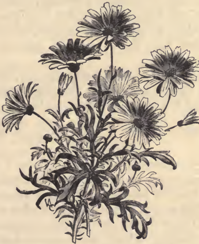
FIG. 7.—CHRYSANTHEMUM FRUTESCENS VAR. ÉTOILE D'OR.

Marie Van Houtte need not be praised here; it gives splendid buds, even in winter, with the help of some artificial heat. In very warm and sheltered corners it blooms well in the open, even