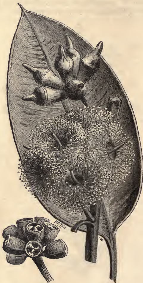
FIG. 4.—EUCALYPTUS ROBUSTA.

E. melliodora gives extremely slender drooping branches, in which graceful leaves accompany small white flowers grouped in trusses of seven ; they have a faint smell of honey.