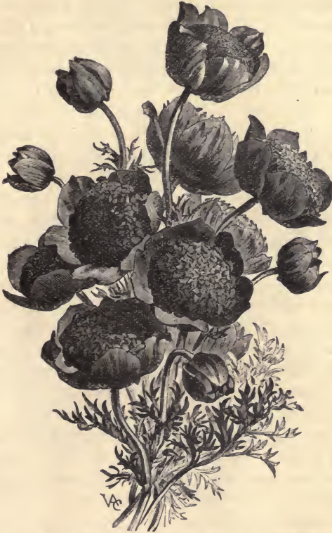
FIG. 12.—ANEMONE CORONARIA VAR. CHAPEAU DE CARDINAL.

Anemones, like Narcissi , are indigenous on the Mediterranean coast. From fields and meadows they were early introduced into gardens. The Provençal varieties of Anemone belong mainly